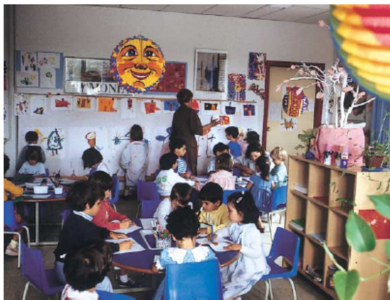
Infant Education is the first level in the education system.

The governments of regions with an official language other than Spanish can establish certain special conditions vis-à-vis language teaching in the area of communication and representation.